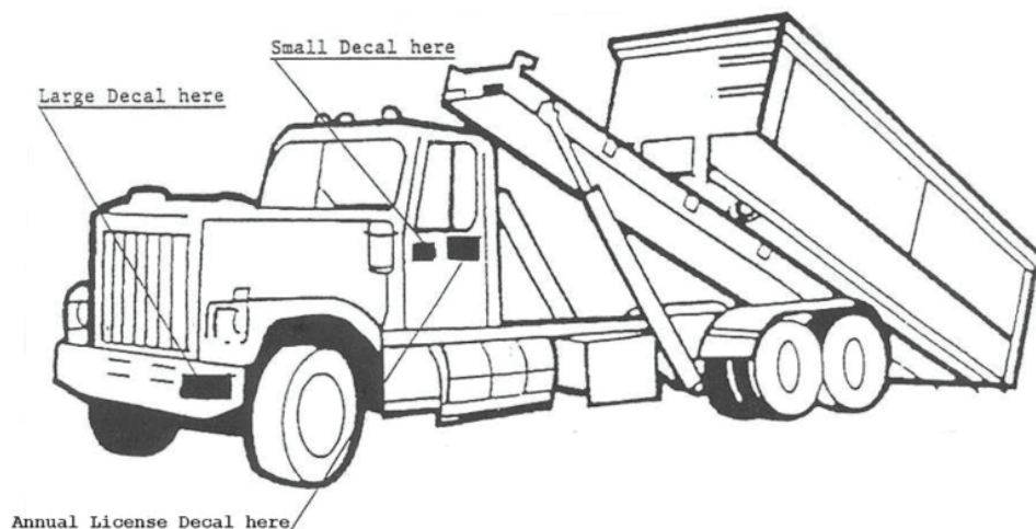
Figure 1. Truck ID Decal Locations

To replace truck R&E account ID decals, contact the R&E Center scale house at 651-768-6671.