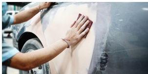
Auto Body Shops