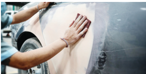
Auto Body Shops